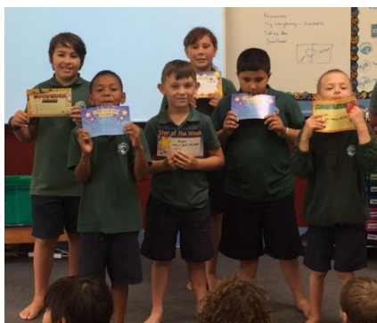
Week 1 Tikapa Moana hub certificate recipients.